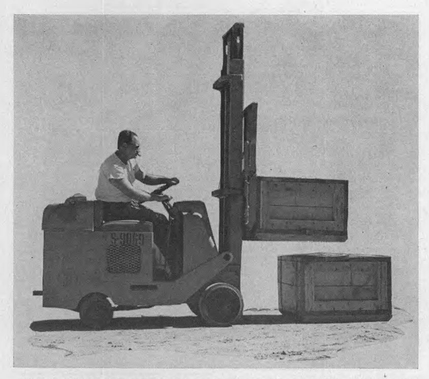
THE HANDIEST GADGET on the base is the fork lift. They come in all sizes and shapes from little box lifters to monstrous machines that can hoist 18,000 pound crates 20 feet in the air with ease. Raymond Summer, 2124-1, uses a 3,000-pound fork lift here to stack small crates.